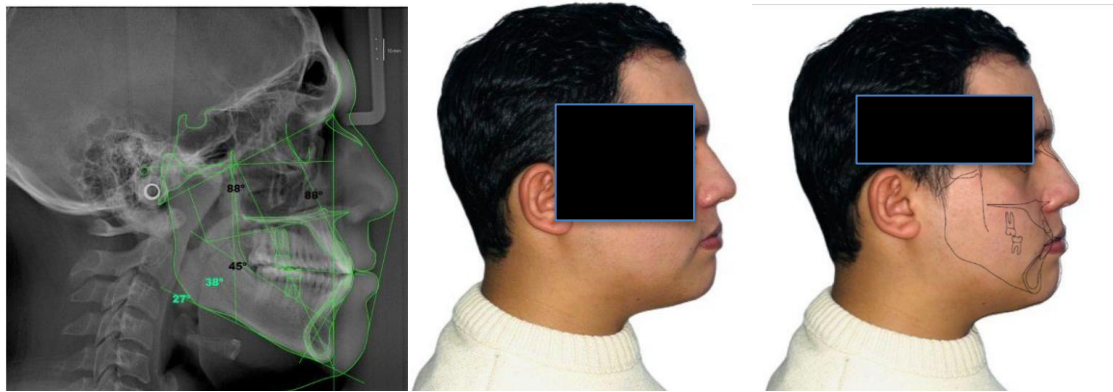
Figs 3, 4 and 5. Images of a group of 34 patients who underwent facial profile evaluation with the help of a cephalometric image and a profile photograph.

Regarding the facial pattern, a total of 37.04% are dolichofacial, 44.44% are mesofacial and 18.5% are brachyfacial. The (mode) of the profilograph obtained when measuring compared with the photographic images of the patients was a mesofacial pattern with 44.44%.